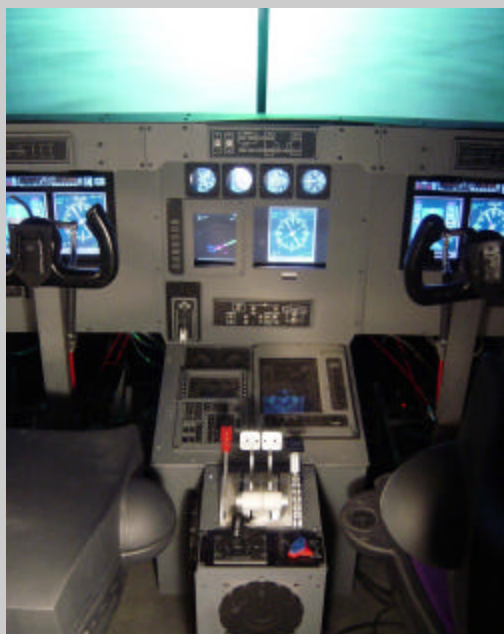
Step into the business end of the VRAC Biz Jet

Imagine, looking at your flight log and thinking about all the different aircraft and interesting places and airports in the world that you've flown to. All this, knowing you haven't had to mortgage your firstborn to accomplish it.