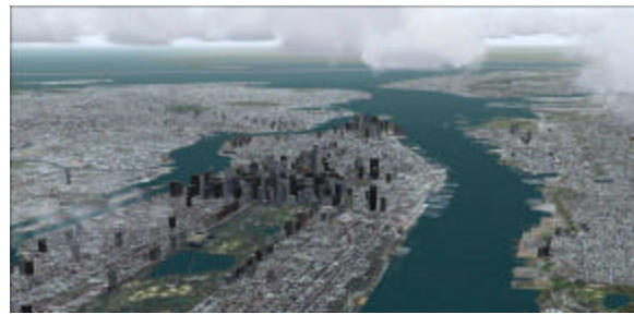
New York sky line from altitude.