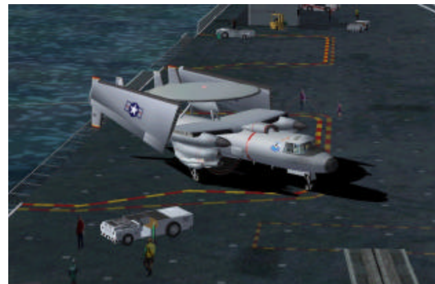
This is what the flight deck looks like! Carrier Operations— The ultimate Challenge to your flying skills!

In the Eagle SimPort, special emphasis will be placed on the exciting challenge of back country flying. Land at some of the most amazing airports in Idaho. With every airport in the world in our database.