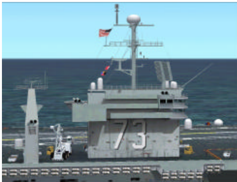
U.S. Navy Carrier