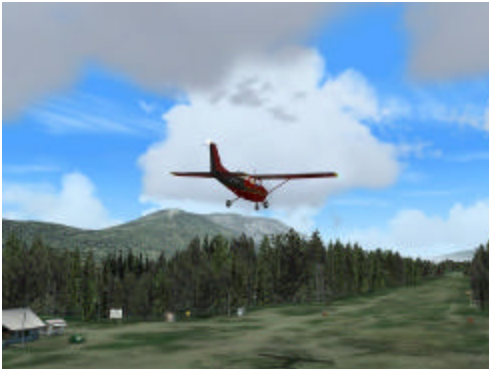
Back country flying waiting for traffic to clear.

The following pictures are actual screen shots from the SIM software.