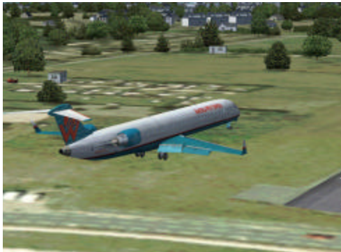
Virtual Traffic On Parallel Final