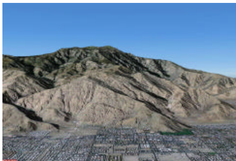
LA Basin with no SMOG! Awesome scenery from all the cockpit windows makes your virtual flight almost real!!

SimPorts USA not only gives you the opportunity to experience the challenge of aviation, but also gives you the experience of flying different real world aircraft. SimPorts USA utilizes the amazing motion simulators built by Virtual Reality Aircraft Corporation, of Eagle, Idaho. The VRAC simulators offer the virtual pilot the experience of flying a Boeing 777, 767, 757, a Beechcraft King Air or Baron, a Pilatus PC-12, a Cessna Citation X, 208 float plane, 206, 182 RG or 172. Carrier Ops are handled by the Hawkeye twin turbo prop or by the Viking S3 twin jet engine sub hunter. Each of these